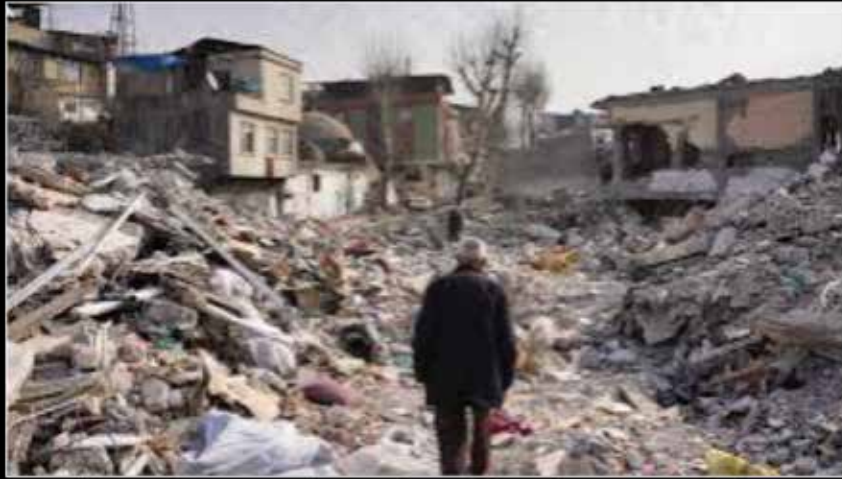
Massive earthquake kills thousands in Turkey/Syria, February 6th, 2023