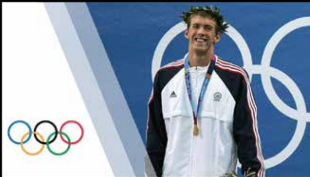
Michael Phelps, 2004 Olympics, Athens