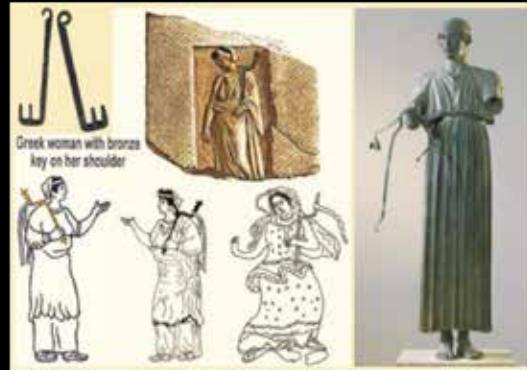
Greek woman with bronze key on her shoulder