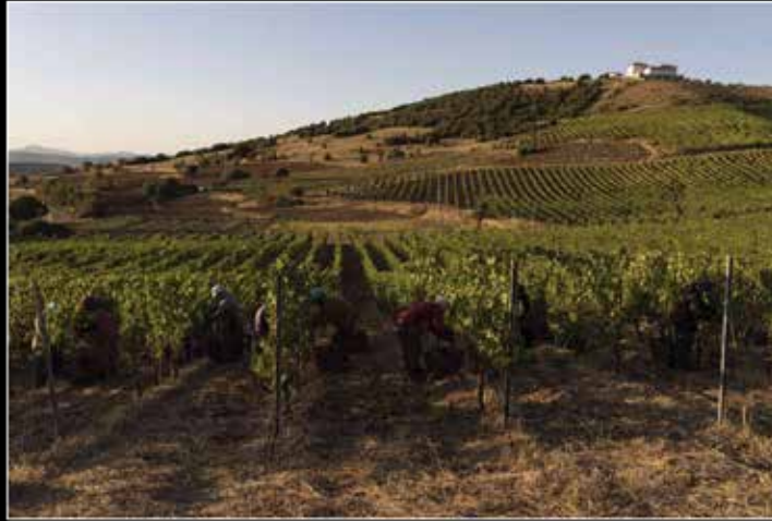
Vineyards near modern-day Alaşehir (Philadelphia) Turkey