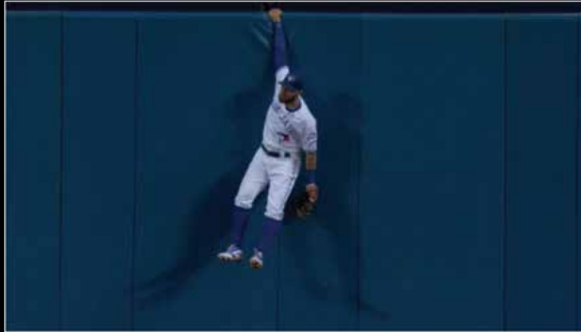
Kevin Pillar, Toronto Blue Jays 2016